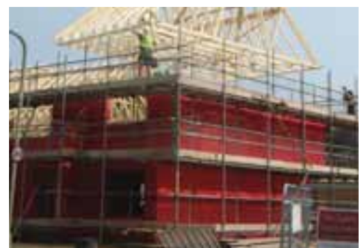
Lambourn Rd Development. See centre pages