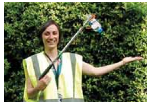
The Rose Hill Community Clean Up Day. See page 4