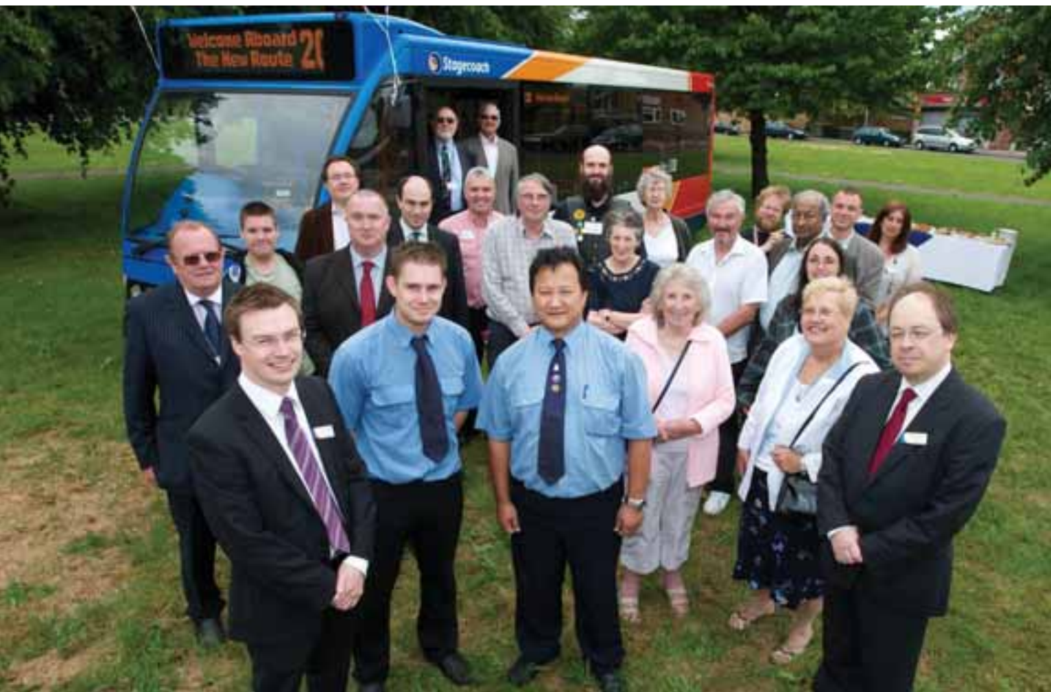
Residents and councillors meet the drivers and celebrate the launch of the new No. 20 bus service