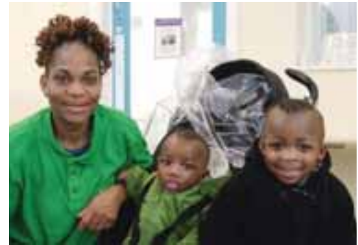
Rose Hill African Womens' Group. See page 3