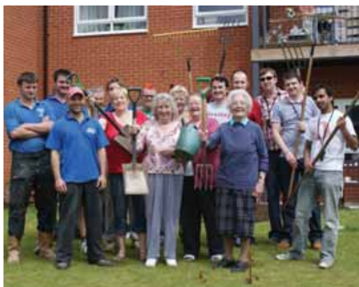
OCHA staff and DWC Contractors with residents of Alice and Margaret House

A GROUP OF RESIDENTS at Alice and Margaret House in Desborough Crescent wanted to develop their large south-facing garden communal garden to make it