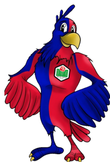
RIO the new mascot designed by an u7's player

While in lock-down we tried to set tasks for the children, to keep them involved with the club. We produced a fab new mascot 'Rio', fun social videos, toilet roll kick up challenge etc.