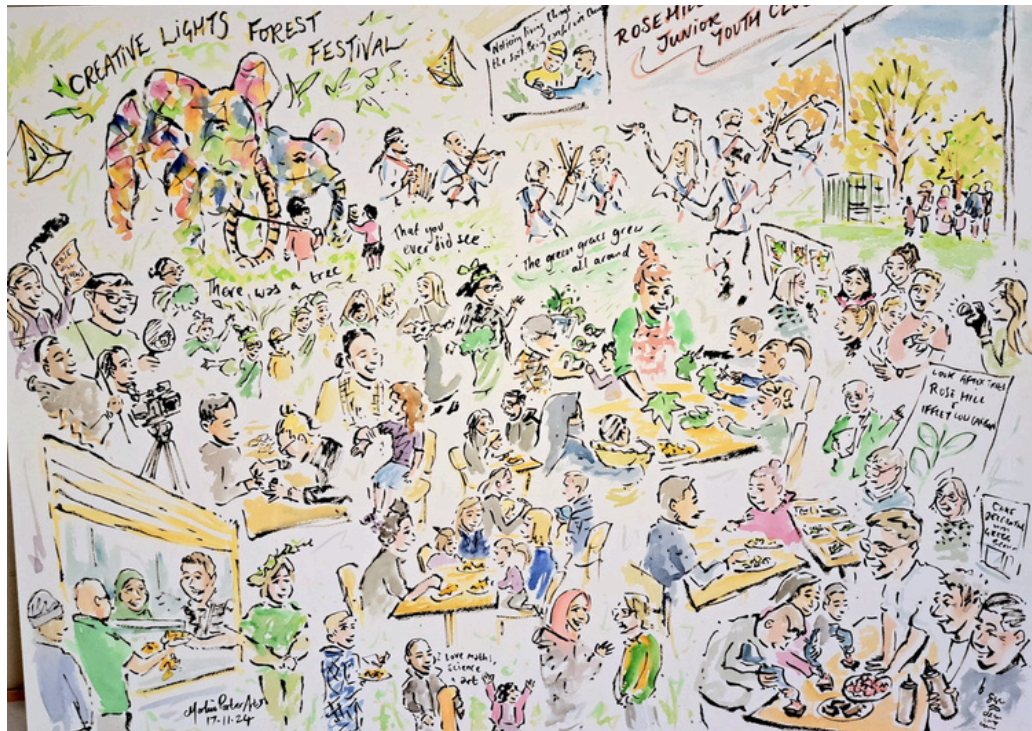
Artwork showcasing the Forest Day Festival event, by local artist Merlin Porter